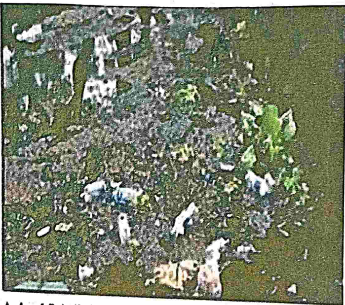
A dead fish (left) was spotted floating near Calcutta Rowing Club on Thursday after flowers, plastic and other puja material was dumped in the water as Chhath ritual

... in various parts of the city... ... and the water... ... their animals like cows, buffaloes etc.